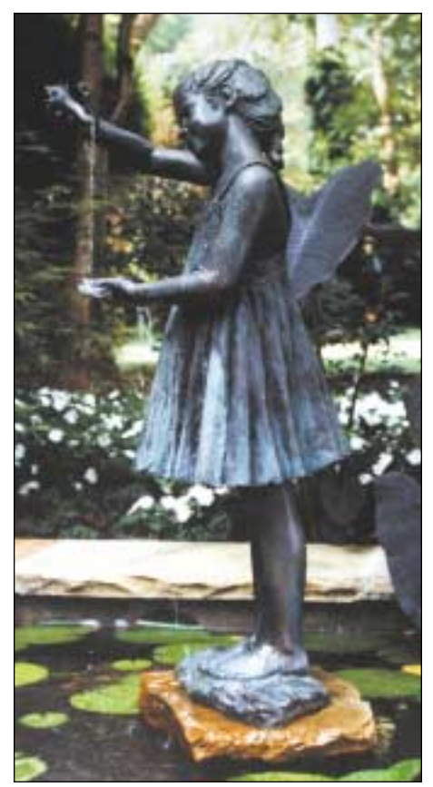
This 39-inch bronze garden fountain, called "Robbie," costs in the $20,000 range.

in homes throughout the area, as well as across the country and overseas.